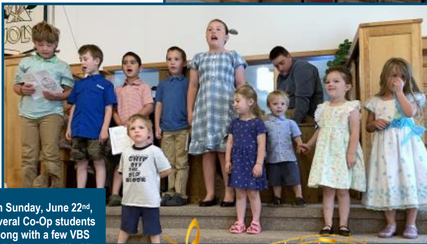
On Sunday, June 22 nd , several Co-Op students along with a few VBS children sang "We All Believe in One True God". It added a sweet note to our worship service.