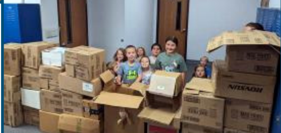
The Co-Op boys and girls have learned about countries of the world. Below, we see "The Great Wall of China" as constructed by the children.

Children are a heritage from the Lord, offspring a reward from him. Psalm 127:3