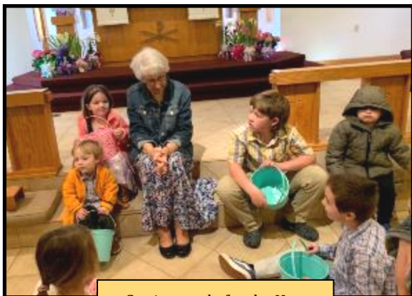
— Getting ready for the Hunt—