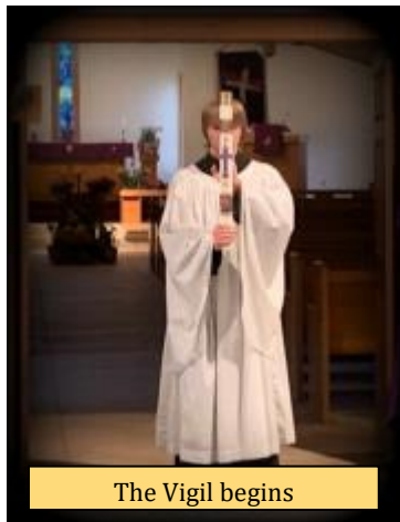
The Vigil begins